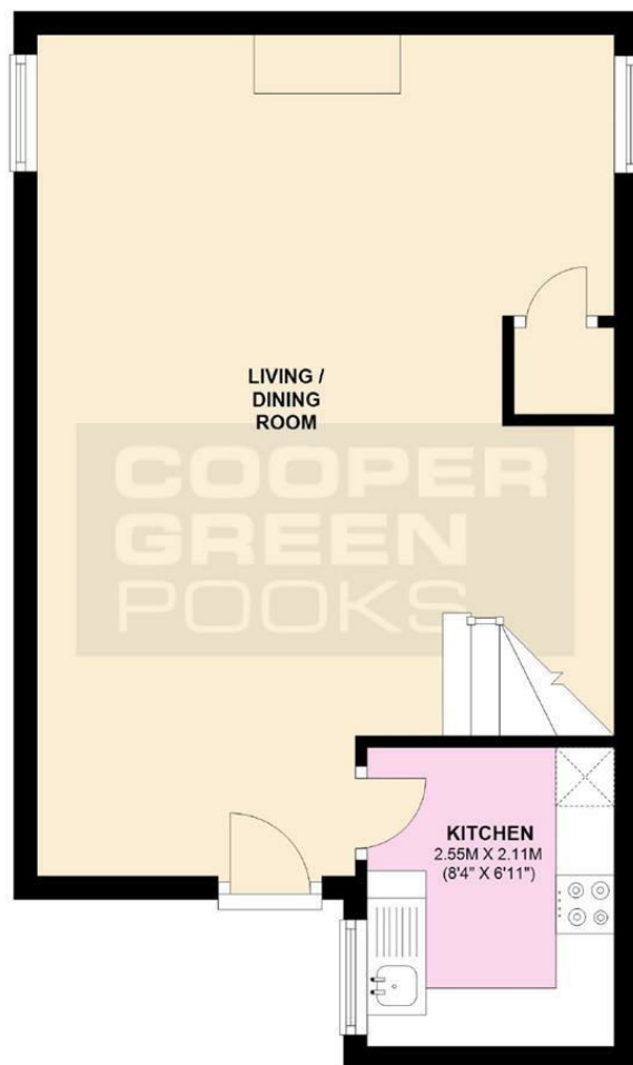
GROUND FLOOR APPROX. 38.5 SQ. METRES (414.0 SQ. FEET)